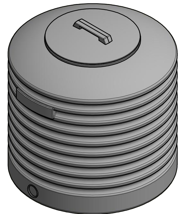
PERSPECTIVE Esc.: 1:10